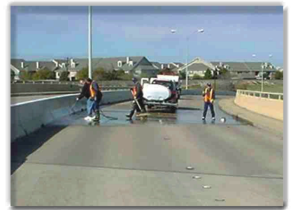
Collins Bridge - Richardson TX