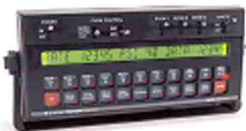
Raven SCS 440 Spray Controller w/ in cab controls